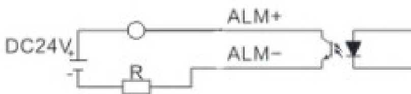
Alarm in place output wiring diagram